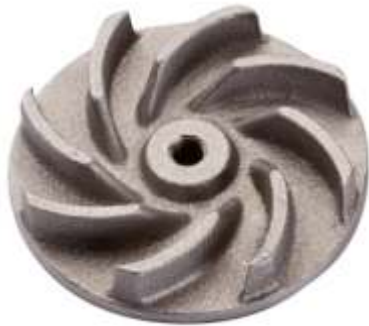
Semi open impeller