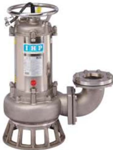
SWA series 4 pole