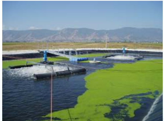
Waste water treatment plant