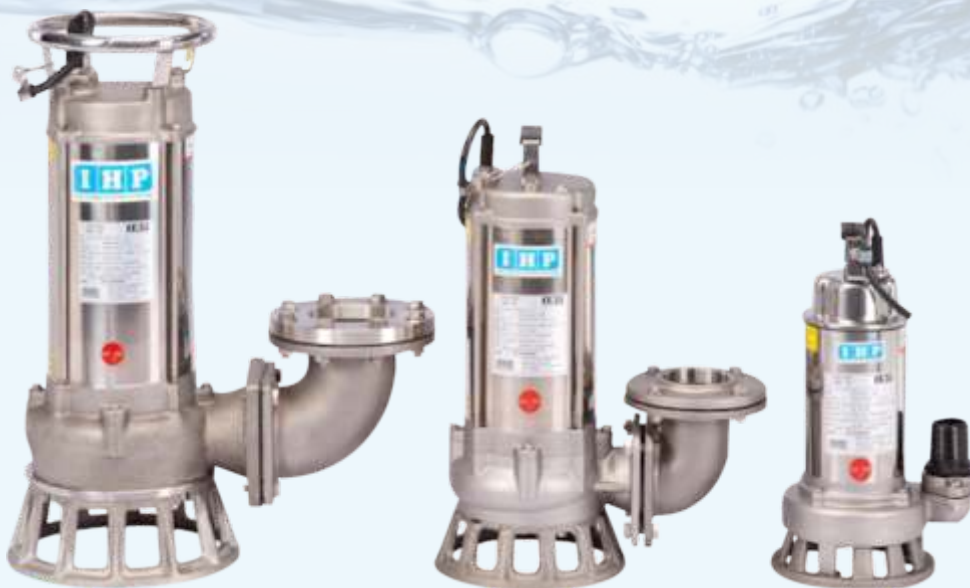
SSW series 2 pole

* We reserve the right to amend specification without prior notice.