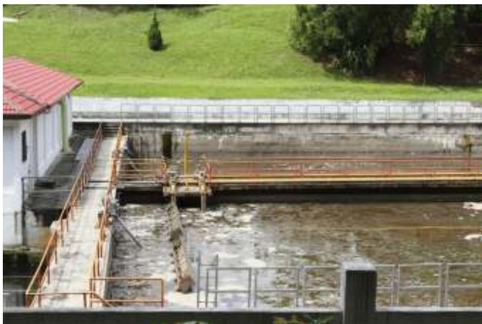
Sewage processing plant